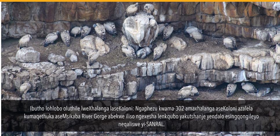
Ibutho lohlobo oluthile lweXhalanga laseKoloni: Ngaphezu kwama-302 amaxhalanga aseKoloni azalela kumaqethuka aseMsikaba River Gorge abekwe iliso ngexesha lenkqubo yakutshanje yendalo esingqongileyo neqaliswe yi-SANRAL.

abeke iliso ngexesha lolwakiwo lwendlela yothutho