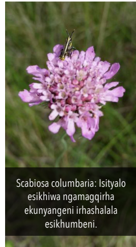
Scabiosa columbaria: Isityalo esikhiwa ngamagqirha ekunyangeni irhashalala esikhumbeni.