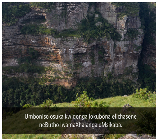
Umboniso osuka kwiqonga lokubona elichasene neButho lwamaXhalanga eMsikaba.

Inkqubo yokubeka iliso imise ukuba imisebenzi yodubulo ethe yenzeka kwiziza zothutho lolwakiwo-ndlela iMtentu neMsikaba, kude kubengoku, ayinaziphumo ezibonakalayo ezingezihlanga ekuqanduseleni kwebutho lamaXhalanga aseKoloni kummandla.