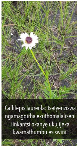
Callilepis laureola: Isetyenziswa ngamagqirha ekuthomalaliseni iinkantsi okanye ukujijeka kwamathumbu esiswini.